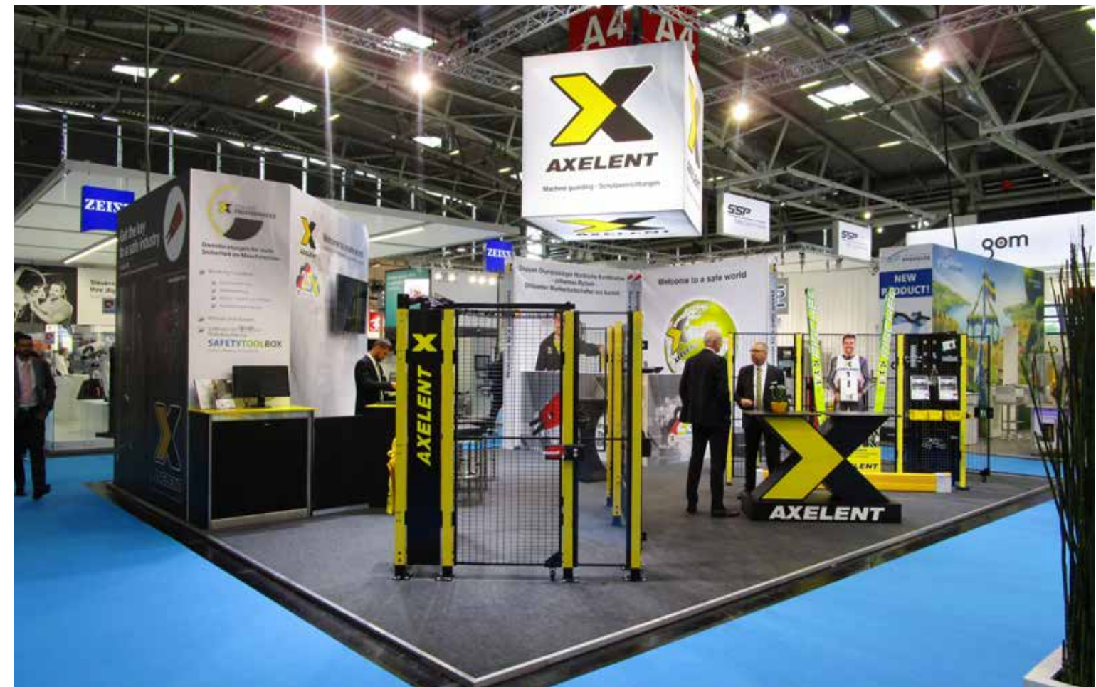
The Axelent booth at Automatica.