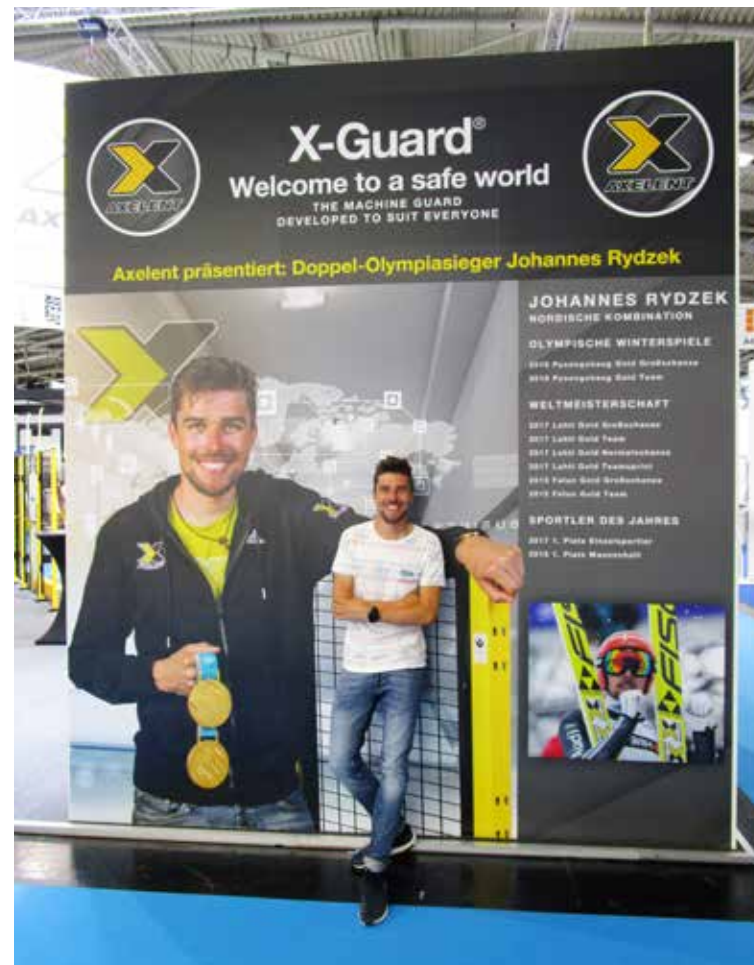
Nordic Combined star Johannes Rydzek.