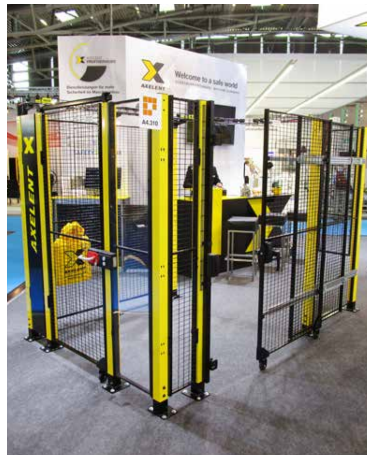
X-Guard at the Axelent booth.