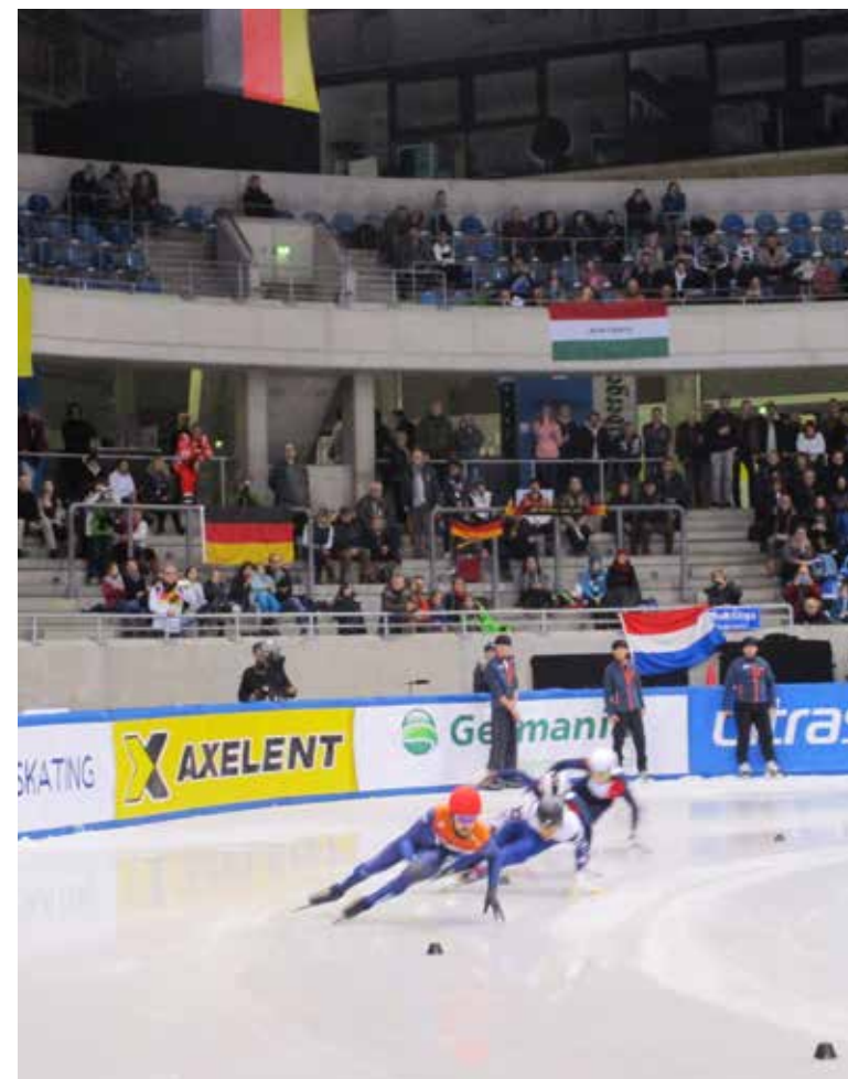
Dutch superstar Sjinkie Knegt in the lead during the European Championships.

Hidden talent? Fable for fashion and photography